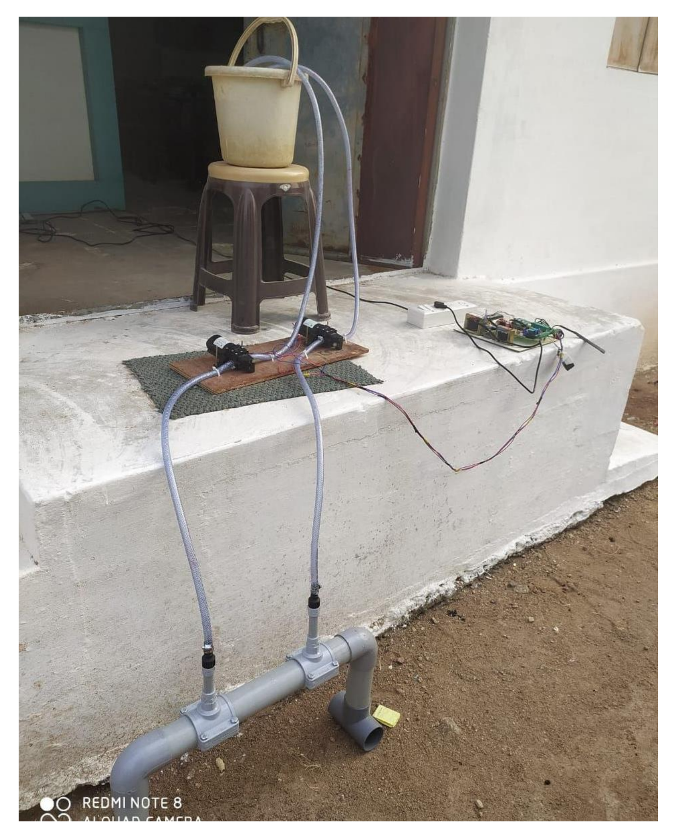
Fig:1.1 experimental setup